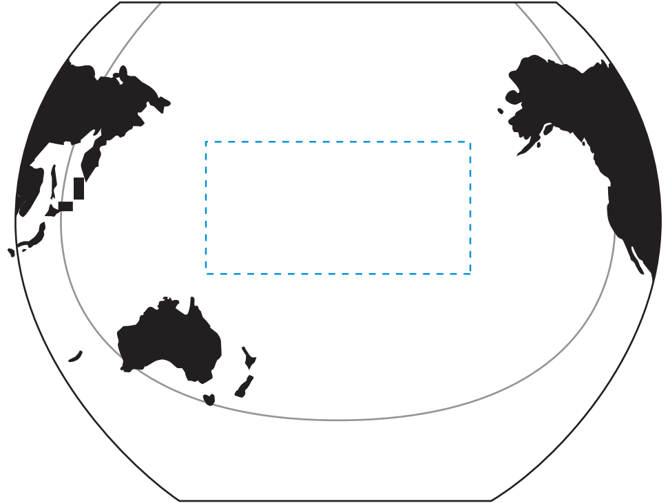
5041 WINDERMERE GLOBAL BOWL 5" DIA. Blue line represents the max image area.